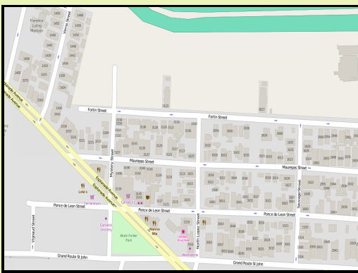
Recently added to Fairgrounds Triangle

Starting this month we're working with building data provided by the City of New Orleans to get every structure in the city mapped. This will make our map richer and bring us closer to having the best, most complete and locally-relevant map of our city.