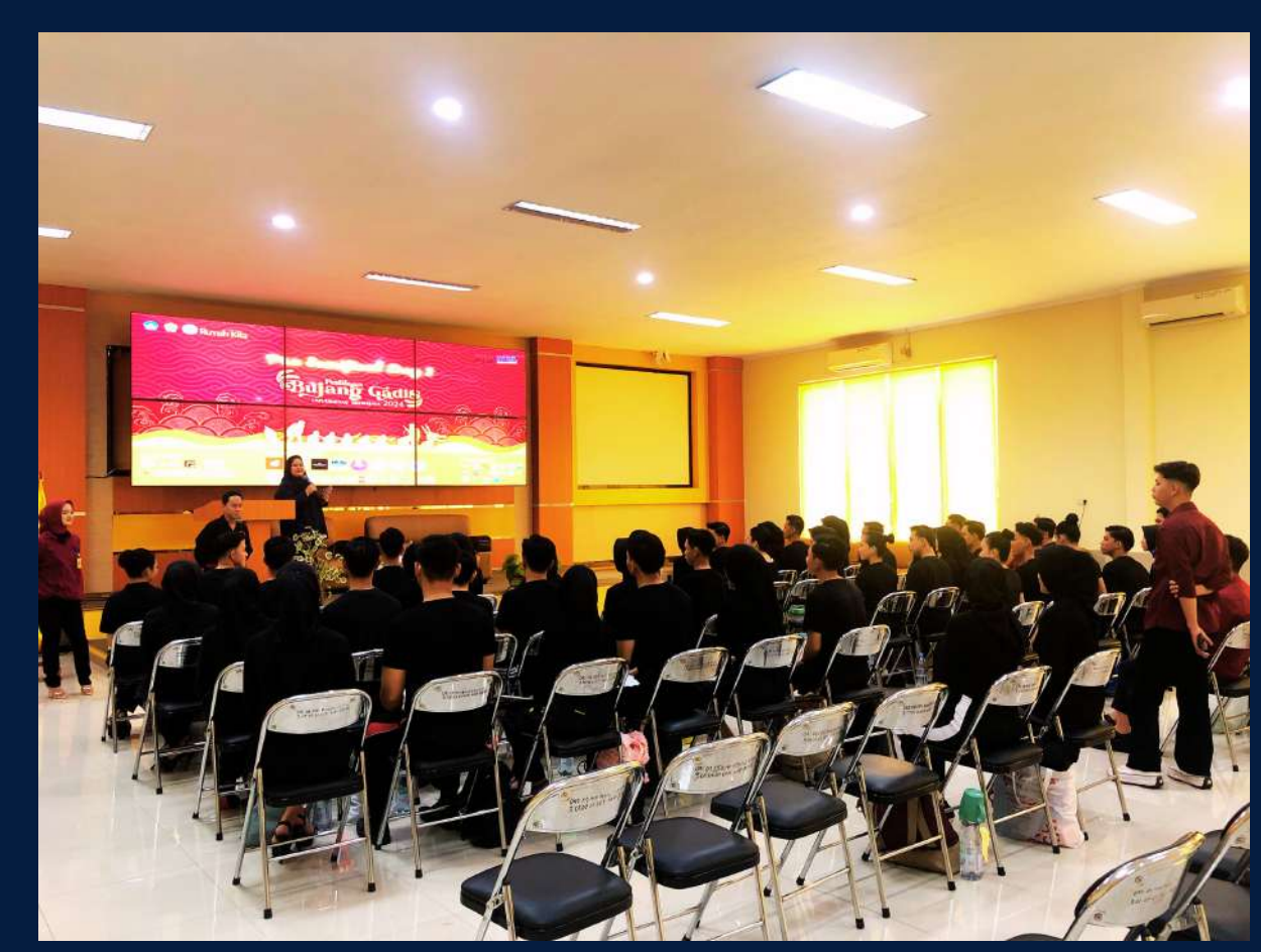
Audience: College students at Sriwijaya University

> Offer free workshops to teach the basics of mapping.