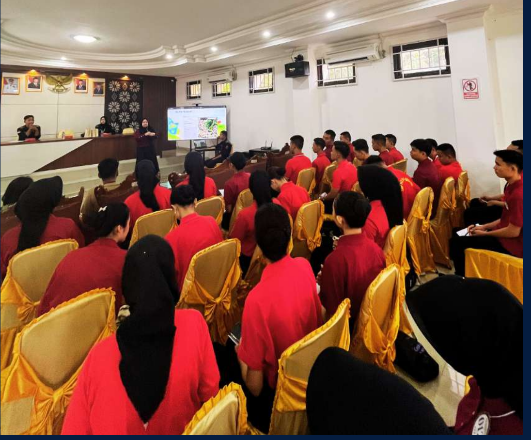
Audience: College students at PGRI University